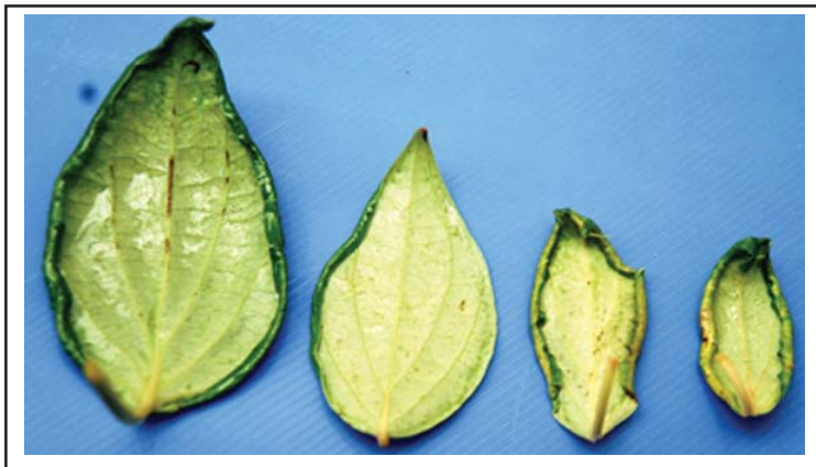
Fig 11. Pepper leaves infested by leaf gall thrips

Infestation by leaf gall thrips ( Liothrips karnyi ) is more serious at higher altitudes especially in younger vines and also in nurseries in the plains. The adults are black and measure 2.5-3.0 mm in length. The larvae and pupae are creamy white. The feeding activity of thrips on leaves causes the leaf margins to curl downwards and inwards resulting in the formation of marginal leaf galls. Later the infested leaves become crinkled and malformed. In severe cases of infestation, the growth of younger vines and cuttings in the nursery is affected. Spray dimethoate (0.05%) during emergence of new flushes in young vines in the field and cuttings in the nursery. Repeat spray after 21 days if necessary.