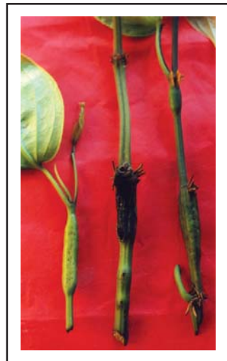
Fig 10. Symptoms of borer infestation

The top shoot borer ( Cydia hemidoxa ) is a serious pest in young plantations. The adult is a tiny moth with a wing span of 10-15 mm with crimson and yellow fore wings and grey hind wings. The larvae bore into tender terminal shoots and feed on internal tissues resulting in blackening and decaying of affected shoots. When successive new shoots are attacked, the growth of the vine is affected. The pest