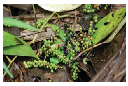
Fig 7. Symptoms of foot rot disease in pepper plantation