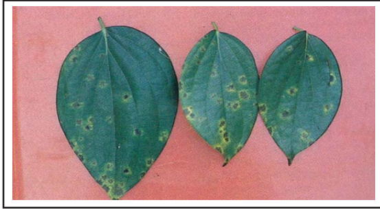
Fig 4. Anthracnose symptom on leaves

Anthracnose and basal wilt: The disease can be controlled by pre-planting treatment of cuttings by immersing in a solution of carbendazim + mancozeb 0.1% for 30 min and spraying Bordeaux mixture 1% or carbendazim+ mancozeb 0.1%.