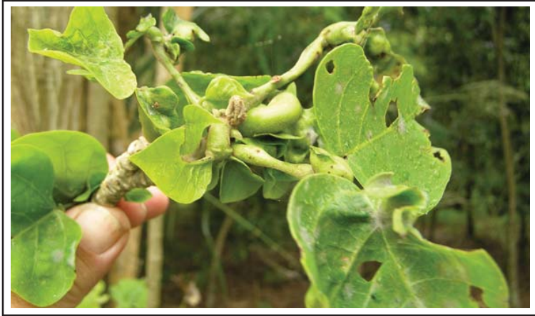
Fig 12. Erythrina branch with gall wasp infestation