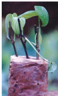
Fig 3. Phytophthora infection in seedling

Phytophthora infection: Spraying and drenching the nursery bags with potassium phosphonate 0.3% (3 ml / litre of 40% formulation) or Metalaxyl-mancozeb 0.125% (1.25 g of Ridomil-mancozeb per 1 litre) at monthly interval is recommended. Alternatively, spraying the cuttings with Bordeaux mixture 1% and drenching with copper oxychloride 0.2% (2 g per litre) at monthly interval can also be adopted.