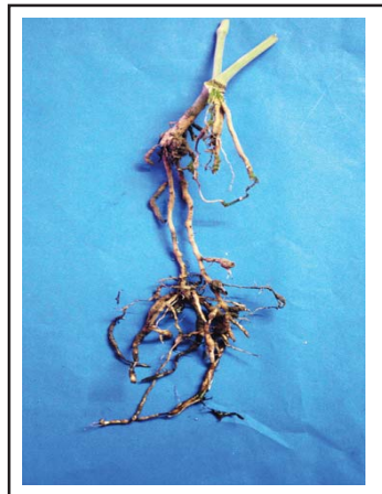
Fig 5. Nematode infestation on roots

Nematode infestation: Root infection (root rot) due to plant parasitic nematodes would result in poor growth, foliar yellowing and some times interveinal chlorosis of leaves of the rooted cuttings. As a preventive measure , nursery mixture may be fortified with talc based formulation of biocontrol agents such as Pochonia chlamydosporia or Trichoderma harzianum @ 1-2 g/kg of soil, the product containing 10^6 cfu fungus/g of substrate. Regularly check the nursery for nematode infection, if any, and remove such bags with severely infected cuttings from the nursery. Application of neem cake @ 1Kg /Pit at the time of planting may also prevent nematode infestation.