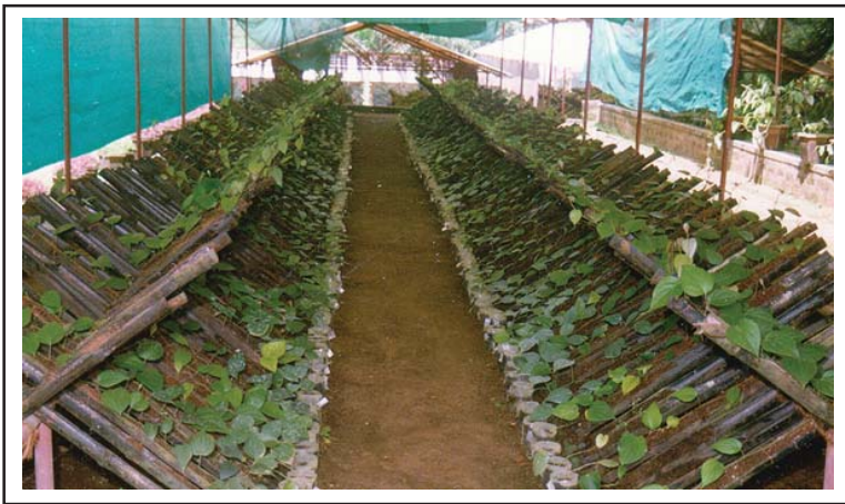
Fig 2. Bamboo method

Mature pepper shoots can be raised on inclined bamboos under shade conditions (coconut grove) or in a net house. These mature shoots can be utilized to raise 2-3 noded rooted cuttings. For this, plant rooted cuttings at one feet depth and distance. Cuttings are allowed to grow on a bamboo/ wooden stake, which are kept at an angle of 45°. To prevent root infection, add decomposed farm yard manure mixed with biocontrol agents to each row, and provide irrigation during summer. After an year the shoots may be harvested. About 15-25 numbers of 2-3 noded cuttings can be produced from a single shoot per year.