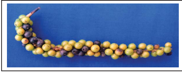
Fig 9. Spike infested with pollu beetle