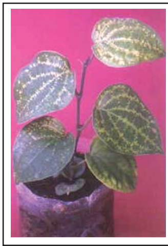
Fig 6. Virus infected seedling

0.05% can control aphids, mealybugs and other sucking insects. Because of the closed placing of cuttings, chances of spread of mealy bug are more in the nursery. Hence regular monitoring of the nursery for mealy bug is important.