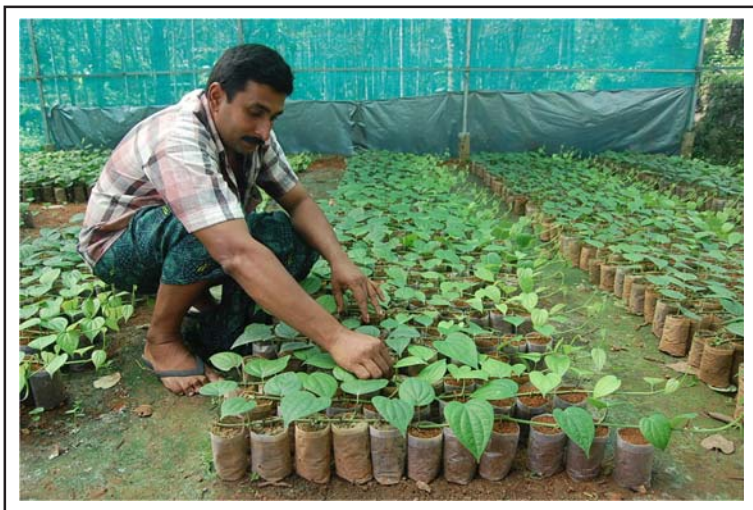
Fig 1. Serpentine method of propagation

The method requires grown up rooted cuttings in 20 x 10 cm poly bags. Rooted cuttings are arranged in one end of the nursery and each cutting is trained to grow horizontally. As shoot grows, bags filled with the nursery mixture are kept underneath each node and allowed to strike roots. It is essential to ensure that each node touches the mixture. The shoot is then allowed to grow for about 3 months that can produce about 10-15 single noded rooted cuttings. This process continues in such a way that a single node gets rooted in each bag until the shoot reaches the last bag in a row. Once 20 nodes get rooted, the first 10 polythene bags with rooted nodes should be separated by cutting the internodes and the cut ends are also pressed into the bag. The axillary bud from each node in the bag sprouts and develops into 4-5 noded rooted cuttings in about 2-3 months. After a gap of another 20-30 days, the rest of the bags also can be separated. About 40-60 rooted cuttings can be produced from a single plant during a year.